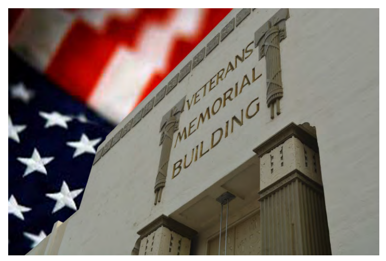
Video and Photos posted on: