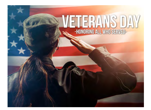
Veterans Day 11/11/23